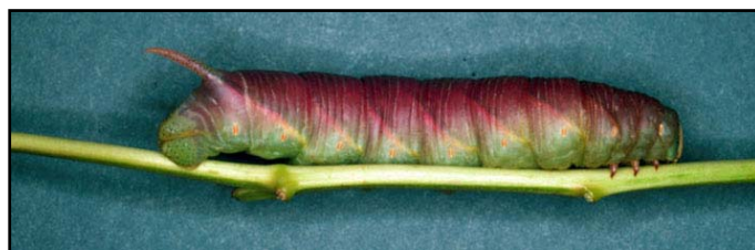
Waved Sphinx caterpillar discovered by Micah and Jack.

Both of these discoveries tie nicely to our previous meal worm unit where we watched meal worms transform from larvae to pupa to the adult darkling beetle.